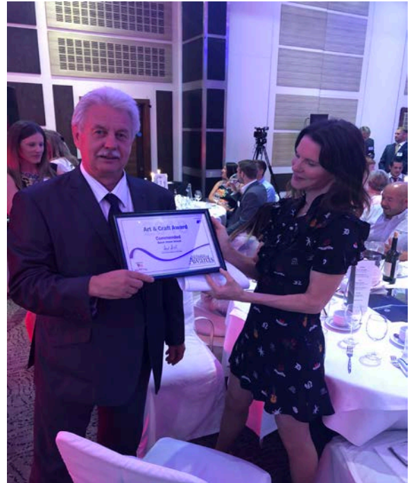
The Principal collecting the award from Susie Dent