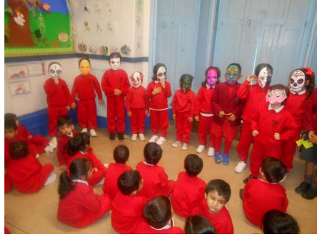
The Lower Prep masks

Beech House School celebrated Halloween by pupils participating in a "Mask Decorating" competition. They were all very scary and Year 10 pupils found it very hard to choose winners on the Upper Prep department. The winners were: